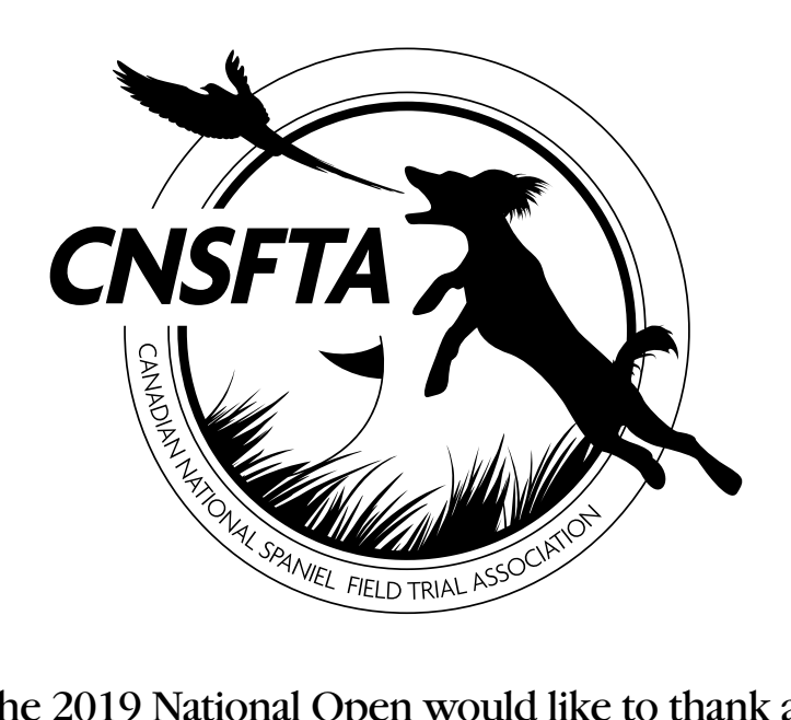
The 2019 National Open would like to thank all its sponsors for their generous support.