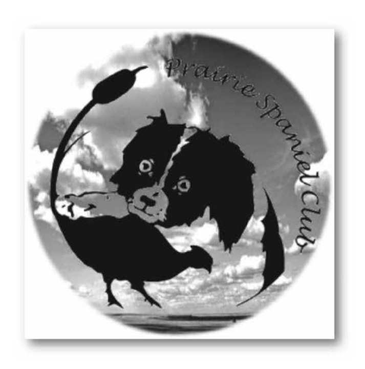
Congratulations to all Competitors and best wishes from our members for the 2019 Canadian National Open Championship Stake